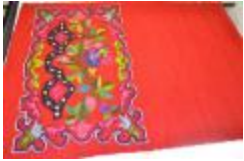
Blanket (2012.32.3) 1860 – 1870