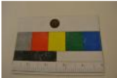
Coin (2014.1.67) 1869,