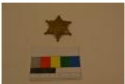
Badge, Police (2014.1.2) 1861 – 1876