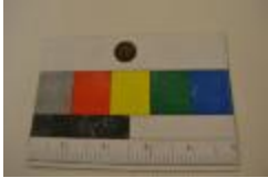
Coin (2014.1.66) 1869,