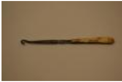
Buttonhook (2001.38.12) 1900, 1800 – 1900