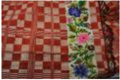
Blanket (2012.32.5) 1860 – 1870