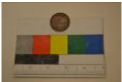
Coin (2014.1.29) 1869,