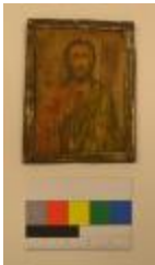
Icon (2006.18.2) circa 1800 – 1909,