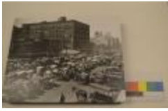
Photograph (F2014.30) 1860 – 1970