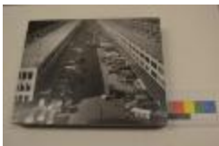
Photograph (F2014.28) 1860 – 1970