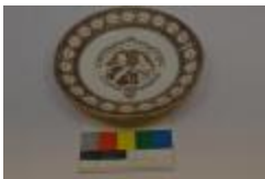
Plate, Commemorative (2015.15.6) October 15, 1867,