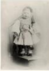
Photograph (1993.69.12) 1869