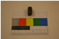
Block, Printing (2008.37.21) 1863 – 1973 Greek Art Printing Company Artifact Collection