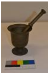
Mortar & Pestle (F2013.9) 1860 – 1930