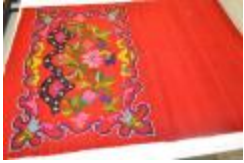
Blanket (2012.32.4) 1860 – 1870