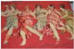
Tapestry (2012.32.6) 1860 – 1870