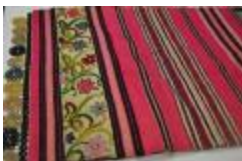
Curtain, Window (2012.32.2) 1860 – 1870