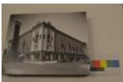
Photograph (F2014.29) 1860 – 1970