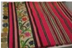
Curtain, Window (2012.32.1) 1860 – 1870