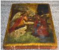
Icon (2006.18.3) circa 1800 – 1909,