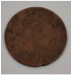
Coin (2014.1.65) 1869,