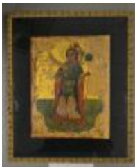
Icon (2001.37.1) 1861,