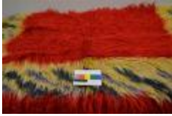
Rug, Flokati (2007.41.10) March 14, 2013, 1940s