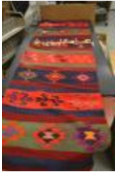
Rug (2018.2.1) circa 1900 – 1929, 1900 – 1929