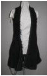
Overcoat (2010.10.4) circa 1925,