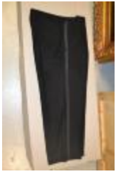
Pants (2003.58.9.3) November 10, 1935, Pagedas Family Collection