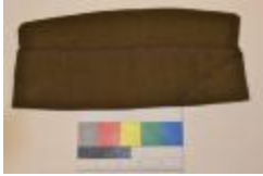
Cap, Service (1994.116.1) 1939 – 1945