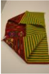
Cover, Pillow (2013.24.3)