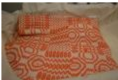
Bedsread (2007.41.3) 1940s,