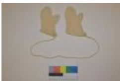
Mitten (1994.41.11.F) February 15, 2013, 1926 Marina Textile Collection