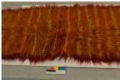
Rug (1997.42.4) February 22, 2013,