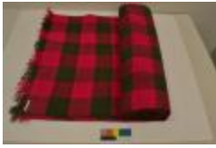
Bedspread (2007.43.5) April 13, 2013, 1930 – 1940