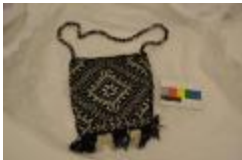
Bag, Tagari (2005.5.33.5)