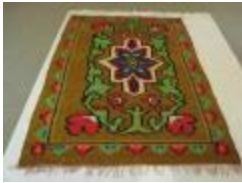
Rug (1993.71.1) circa 1900,