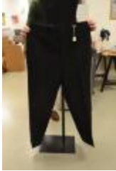
Pants (1998.25.1.B) 1942, 1942 Defenders of Democracy