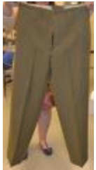
Pants (2017.1.2B) 1943, 1943 – 1946