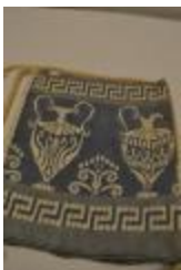
Bag, Tagari (2003.21.1.2.) February 25, 2013, 1940 – 1960