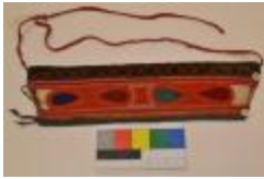
Cumberband (1994.51.B) 1890 – 1920 Bisioulis Collection