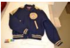
Jacket (1994.123.1) 1954, 1954