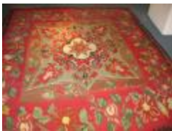
Rug (2007.23.1) circa 1900,