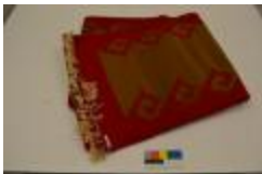
Runner (2007.41.6) 1940s,