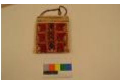
Bag (2003.33.22) 1800s, BARBATSULY