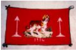
Wall Hanging (2003.33.2) 1914, BARBATSULY