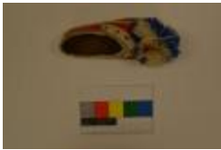
Shoe, Tsarouxia (2007.42.2.8.A) 1950s,