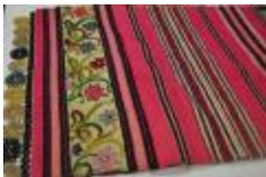
Curtain, Window (2012.32.2) 1860 – 1870