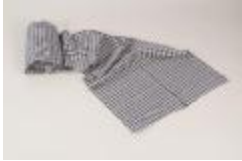
Bolt, Cloth (2004.4.1) circa 1930,