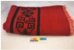
Blanket (1995.42.10) before 1920,