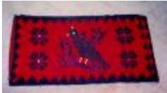
Pillowcase (2003.33.4.B) 1890s, BARBATSULY