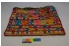
Bag, Tagari (2000.1.9)