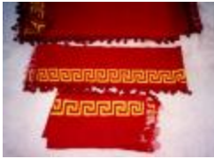
Drapery (2003.33.5.E) 1800s,