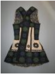
Vest (2010.30.27) 1940s,