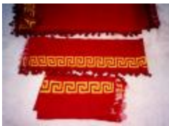
Drapery (2003.33.5.H) 1800s,