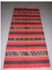
Carpet (2011.4.3) Paul Kachoris Textile Collection