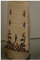
Skirt (1998.26.1.B) 1970, 1970