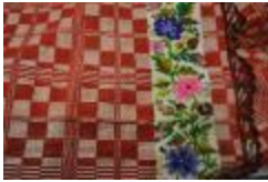
Blanket (2012.32.5) 1860 – 1870