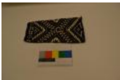
Legging (2010.30.25.A) 1960s,