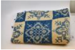
Bedspread (1995.23.3) 1921,