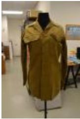
Shirt (1994.117.2.B) Defenders of Democracy