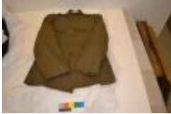
Jacket (1998.22.1.A) circa 1918, Defenders of Democracy