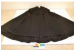
Cape (1995.45.2) 1910 – 1930 Estelle Collection