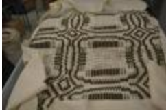
Bedsread (2007.41.1) 1940s,