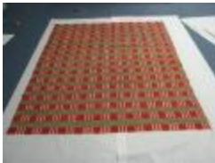
Blanket (2008.34.1) 1930s,