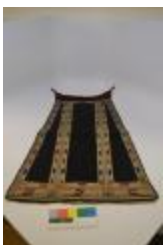
Apron (1993.61.1) 19th century,