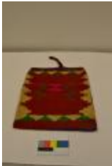
Purse (1997.42.2) February 26, 2013, 1940 – 1960