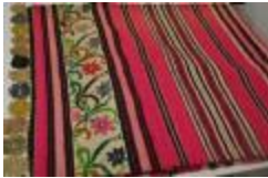
Curtain, Window (2012.32.1) 1860 – 1870