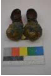
Shoe, Tsarouxia (2006.16.5.A) 1937,