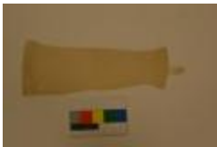
Stocking (2007.42.2.5.B) 1950s,