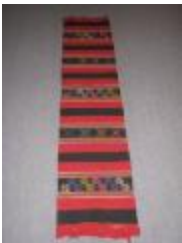
Carpet (2011.4.2) Paul Kachoris Textile Collection