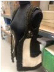
Vest (2019.5.2) 1940s