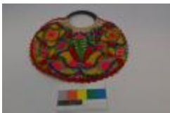
Purse (1993.63.1) 1920 – 1939