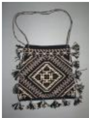
Purse (2010.30.16) 1960s,