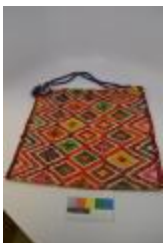
Bag, Tagari (2007.36.10)