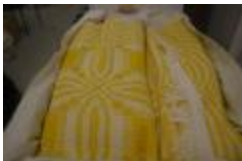
Bedsread (2007.41.4) 1940s,