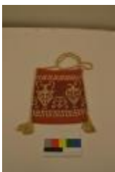
Bag, Tagari (2003.21.1.3) February 25, 2013, 1940 – 1960