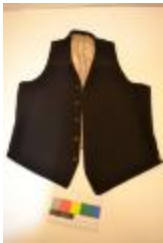
Vest (2006.23.1.B) 1921,