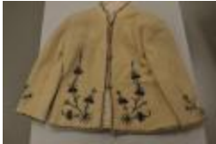
Jacket (2005.5.31) 1960s,