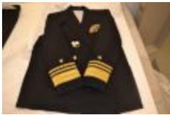
Jacket (1998.24.1.A) circa 1990, Defenders of Democracy