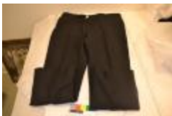
Pants (1998.24.1.B) circa 1990, Defenders of Democracy