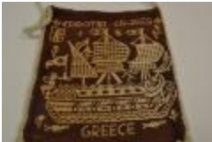
Bag, Tagari (2003.21.1.1) February 25, 2013, 1940 – 1960