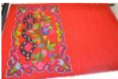
Blanket (2012.32.3) 1860 – 1870