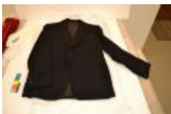
Jacket (1995.11.2.A) 1929,