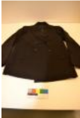
Jacket (2006.23.1.A) 1921,