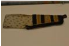
Sleeve (2010.30.21.A) 1960s,