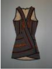
Vest (2010.30.29) 1940s,