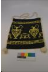
Bag, Tagari (2001.31.42)