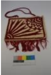
Bag, Tagari (2003.36.22)