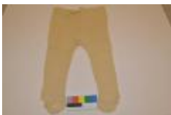
Legging (1994.41.11.E) February 15, 2013, 1926 Marina Textile Collection