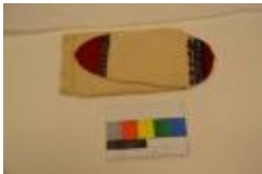
Sock (2003.33.19.B) before 1918, BARBATSULY