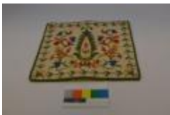
Cover, Pillow (2004.5.55.B)