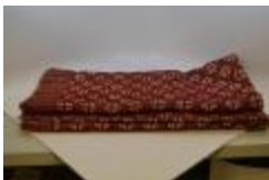
Blanket (2004.9.3) 1949,