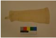
Stocking (2007.42.2.5.A) 1950s,