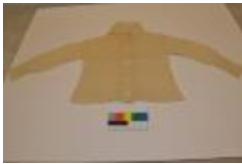
Jacket (1994.41.11.C) February 15, 2013, 1926 Marina Textile Collection