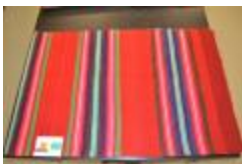
Blanket (2016.1.1) 1911 – 1954