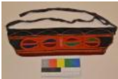
Cumberband (1994.51.C) February 22, 2013, 1890 – 1920 Bisioulis Collection