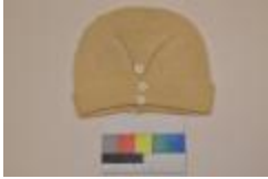
Cap (1994.41.11.G) February 15, 2013, 1926 Marina Textile Collection