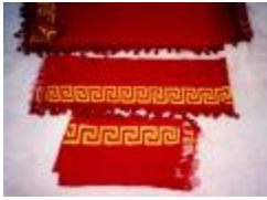
Drapery (2003.33.5.C) 1800s,