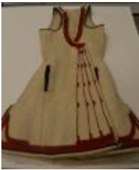
Jacket (2012.30.1) 1940s,