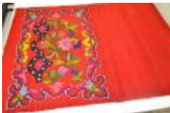
Blanket (2012.32.4) 1860 – 1870