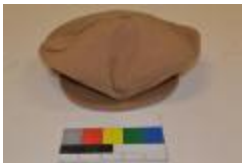
Flatcap (1994.32.1) 1934 – 1989