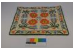
Mat, Table (2007.36.9)