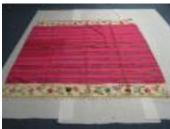
Blanket (2009.4.2) 1904 – 1926