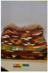
Rug (2004.17.2) 1940s,