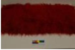
Rug (2002.32.1) February 22, 2013,