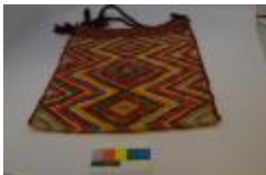
Bag, Tagari (F2016.236)