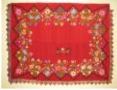
Bedspread (1996.18.1) 1954,