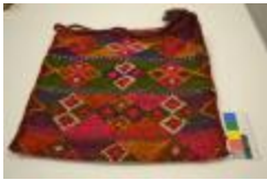
Bag (2002.7.3) 1940s,