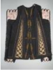
Jacket (2010.30.19) 1960s,