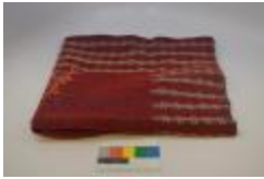
Blanket (2002.4.1) 1906,