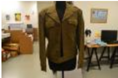
Jacket (1998.27) 1942, 1942