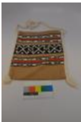
Bag, Tagari (2007.36.7)