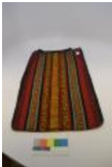
Bag, Tagari (1994.29.2)