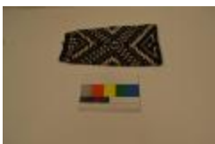
Legging (2010.30.25.B) 1960s,