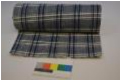
Bolt, Cloth (2004.4.2) circa 1930,