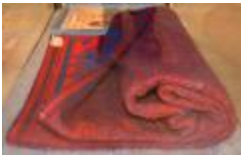
Blanket (2005.25.2) 1946 – 1955,