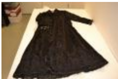
Coat (1999.2) 1907 – 1908,