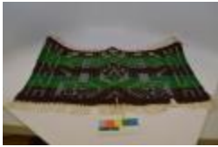
Rug (2001.33.1) 1950s,