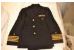
Jacket (1998.19.1.A) 1941 – 1961 Defenders of Democracy