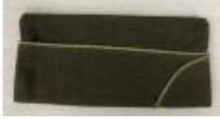
Cap, Garrison (2019.12.4)