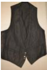
Vest (2003.58.9.2) November 10, 1935, Pagedas Family Collection