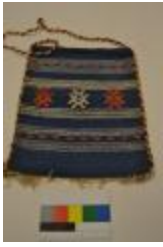
Bag, Tagari (2003.21.1.4) February 25, 2013, 1940 – 1960