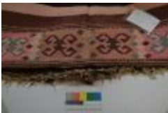
Blanket (2005.26.7) 1928,