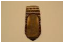
Slipper (2010.30.24.B) 1960s,