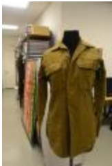
Shirt (1994.117.1.A) Defenders of Democracy