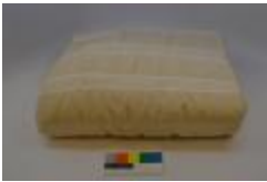
Bedsread (2005.25.3) 1946 – 1950