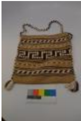
Bag, Tagari (2007.36.6)