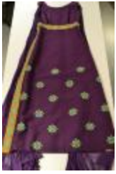
Dress (2011.6.19) 1965,