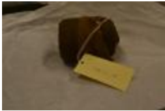
Stocking (1998.22.1.F) 1918, Defenders of Democracy