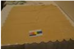
Blanket (2005.5.28) 1930s,