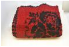
Bedsread (2001.15.6) 1943, 1943