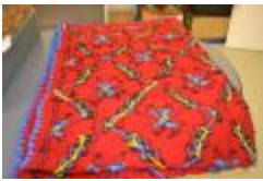
Blanket (2005.25.1) 1946 – 1950,