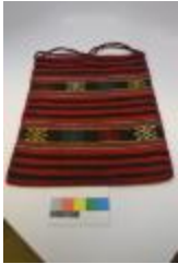
Bag, Tagari (1995.21.1)