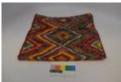
Bag, Tagari (2007.36.8)