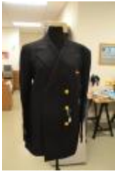
Jacket (1998.25.1.A) 1942, 1942 Defenders of Democracy