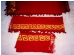
Drapery (2003.33.5.I) 1800s,