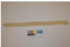
Belt (1994.41.11.D) February 15, 2013, 1926 Marina Textile Collection