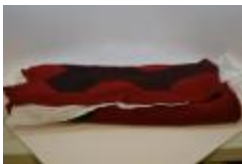
Blanket (2004.9.7) 1949,