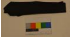
Necktie (1998.19.3.B) 1940s,