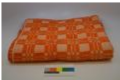
Bedsread (1998.1.1) 1920, 1920