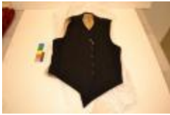
Vest (1995.11.2.C) 1939, 1939