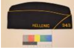
Cap, Service (1994.8.3) 1920 – 1935