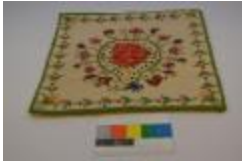
Cover, Pillow (2004.5.55.A)