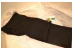
Pants (1998.19.1.D) 1941 – 1961 Defenders of Democracy