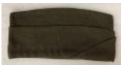
Cap, Garrison (2019.12.3) November 13, 1950