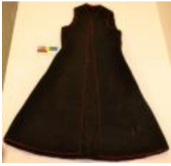
Vest (1994.35.1) 1800s,