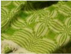
Bedsread (2007.41.2) 1940s,