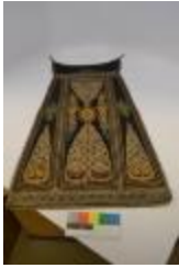
Apron (1993.2.2) 1900s, Thread of Tradition: The Wedding