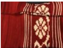
Rug (2019.10.1) circa 1947