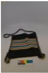
Bag, Tagari (1998.3.1) 1957, 1957