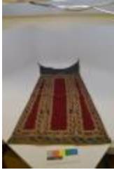
Apron (1993.2.3) 1900s, Threads of Tradition: The Wedding