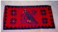
Pillowcase (2003.33.4.C) 1890s, BARBATSULY