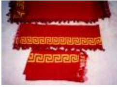
Drapery (2003.33.5.F) 1800s,