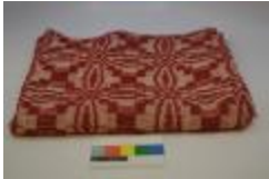
Runner (2001.33.2) 1950s,