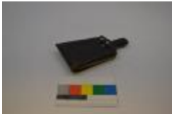
Brush, Polish (F2015.63) circa 1925,