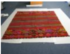
Blanket (2009.4.3) 1904 – 1926