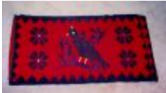
Pillowcase (2003.33.4.A) 1890s, BARBATSULY