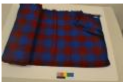
Bedspread (2007.43.4) April 13, 2013, 1930 – 1940