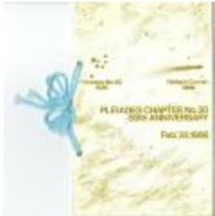
Booklet (2002.51.36) February 25, 1986,