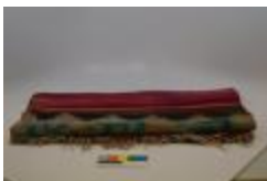
Rug (1994.33.1) 1920,