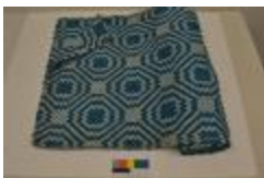
Bedspread (2007.43.3) April 13, 2013, 1930 – 1940