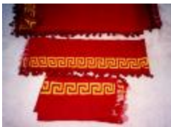
Drapery (2003.33.5.J) 1800s,