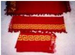
Drapery (2003.33.5.A) 1800s,