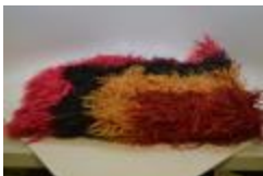
Rug (2004.9.1) 1949,