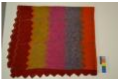
Blanket (2015.1.1) 1912,