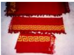
Drapery (2003.33.5.B) 1800s,