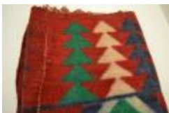
Blanket (2007.31.2) circa 1900,