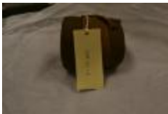
Stocking (1998.22.1.E) 1918, 1918 Defenders of Democracy