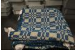
Blanket (1997.41.1) 1920s, 1920s