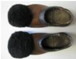
Shoe, Tsarouxia (2008.27.6.B)