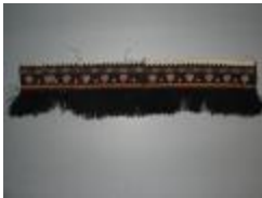
Cloth Fragment (2010.30.23) 1960s,