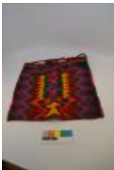
Bag, Tagari (1998.6.1) 1943,