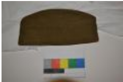
Cap (1998.22.1.G) 1918, 1918 Defenders of Democracy