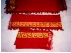
Drapery (2003.33.5.D) 1800s,