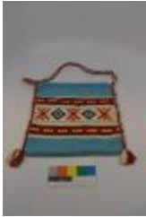
Bag, Tagari (2007.36.5)