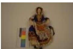
Doll (1994.80.A) 1950 – 1970