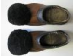
Shoe, Tsarouxia (2008.27.6.A)