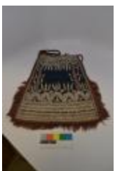
Apron (2005.5.14) 19th century,