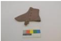
Spat (1996.21.A) 1920s,