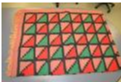
Runner (2001.33.4) 1950s,