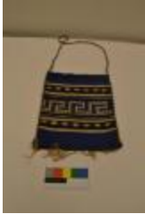
Bag, Tagari (2003.21.1.5) February 25, 2013, 1940 – 1960