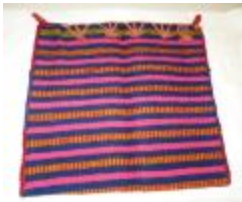
Bag, Tagari (2004.17.5) 1940s,