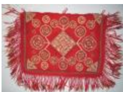
Blanket (2010.30.26) 1960s,