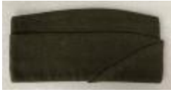
Cap, Garrison (2019.12.5) December 5, 1950