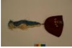
Fez (2007.42.1.1) 1950s,