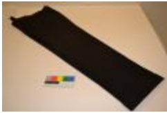
Pants (2006.23.1.C) 1921,