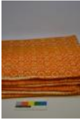
Bedsread (1998.1.3) 1920 – 1930, 1920 – 1930