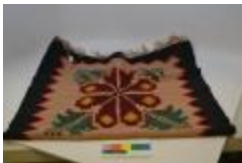
Rug (1993.52.5) 1959,