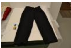
Pants (1995.11.2.B) 1939,