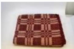
Bedspread (2001.15.5) 1943, 1943