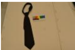
Necktie (1998.19.1.B) 1941 – 1961 Defenders of Democracy