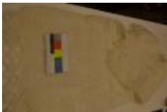
Shawl (1994.41.8) circa 1920,