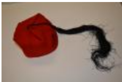
Fez (2012.24.3) 1967,