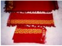
Drapery (2003.33.5.G) 1800s,