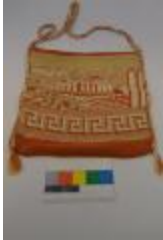
Bag (1993.52.1) before 1920,