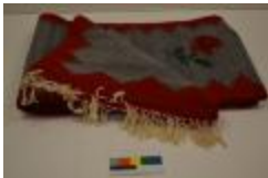
Runner (2007.41.5) 1940s,