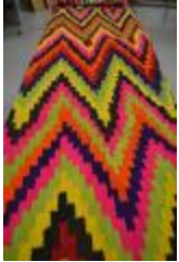
Blanket (2012.14.1) 1890s,