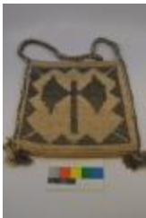
Bag (1993.52.2) 1950s