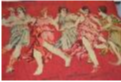
Tapestry (2012.32.6) 1860 – 1870