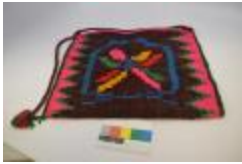
Bag, Tagari (2007.36.4)