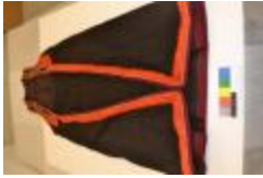
Vest (1994.51.A) 1890 – 1920 Bisioulis Collection