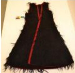
Vest (1994.35.2) 1800s,