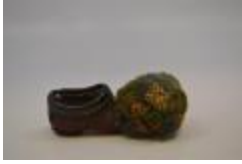
Shoe, Tsarouxia (2006.16.5.B) 1937,