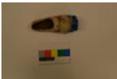
Shoe, Tsarouxia (2007.42.2.8.B) 1950s,