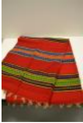
Rug, Throw (2013.24.1)