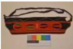
Cumberband (1994.51.D) February 22, 2013, 1890 – 1920 Bisioulis Collection