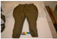
Pants (1998.22.1.B) circa 1918, Defenders of Democracy