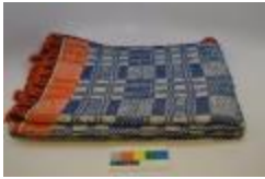
Bedsread (1998.1.2) 1920, 1920