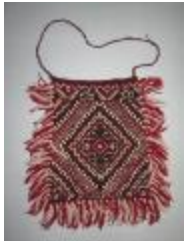
Purse (2010.30.17) 1960s,