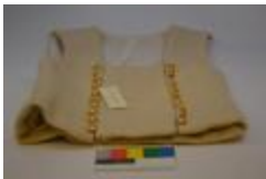
Vest (1998.26.1.A) 1970, 1970