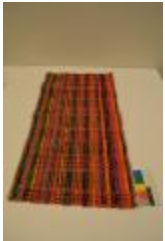
Blanket (2004.17.4) 1940s,