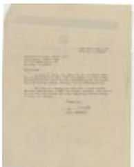
Letter (2018.8.1B) December 9, 1941