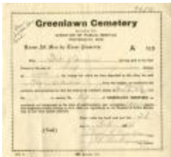
Receipt (2016.2.18) 1944