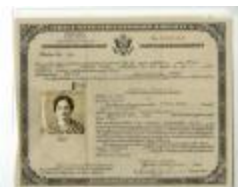
Certificate, Citizenship (2016.2.2) 1944 Economou Family Papers