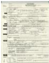
Certificate, Death (2016.2.17) 1993 Economou Family Papers