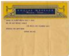
Telegram (2016.2.10) 1931 Economou Family Papers