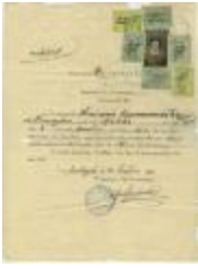
Certificate, Birth (2016.2.31a) 1926 Economou Family Papers