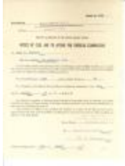
Orders, Military (1993.42.11A) August 2, 1917,