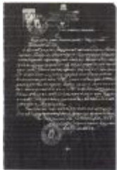
Certificate, Birth (1993.42.3) January 10, 1891,