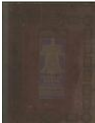
Archival Material (AR AHEPA Con Books) NHM Archives