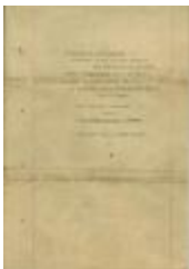
Certificate, Marriage (2016.2.19) November 3, 1926 Economou Family Papers