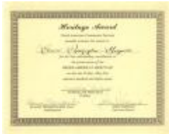
Certificate (2017.7.7) Theano Margaris Collection