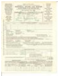
Return, Tax (1993.42.5) 1920,