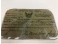
Registration (1993.42.19) June 5, 1917