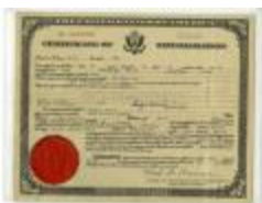
Certificate, Citizenship (2016.2.3) 1928 Economou Family Papers