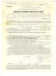
Certificate (1993.42.10A) August 17, 1917