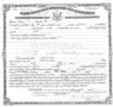
Certificate, Naturalization (1993.11.3) May 10, 1920,