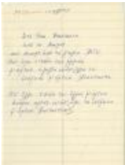
Poem (2016.2.32) 1975 Economou Family Papers