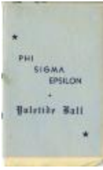
Pamphlet (2001.1.6) 1940