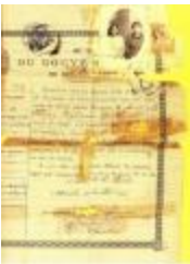
Photograph (2007.16.47.a) June 20, 1920,