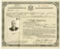
Certificate, Citizenship (2003.42.2.1) April 5, 1893