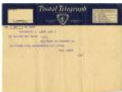
Telegram (2016.2.27) 1931 Economou Family Papers