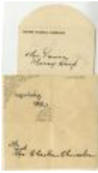
Letter (2016.2.21) Economou Family Papers