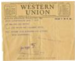
Telegram (2016.2.24) 1931 Economou Family Papers