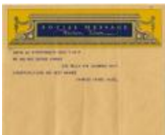
Telegram (2016.2.11) 1931 Economou Family Papers