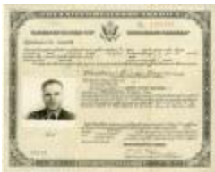
Certificate, Citizenship (2003.42.2.2) June 11, 1926