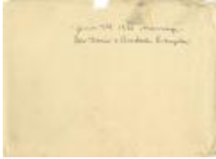
Envelope (2016.2.22) 1931 Economou Family Papers