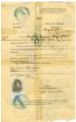
Record, Immigration (2019.13.1) August 25, 1920