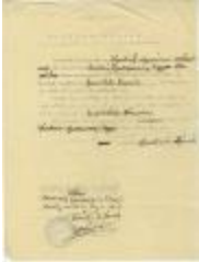
Document, Travel (2016.2.31b) 1926 Economou Family Papers