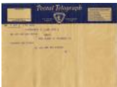
Telegram (2016.2.12) 1931 Economou Family Papers