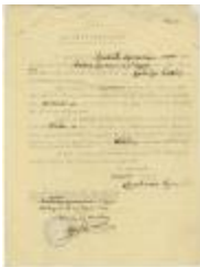
Document, Travel (2016.2.31c) 1926 Economou Family Papers