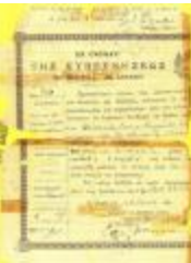
Photograph (2007.16.47.b) June 20, 1920,