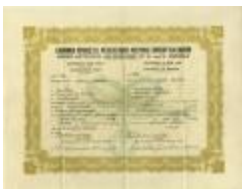
Certificate, Marriage (2016.2.29) 1931 Economou Family Papers