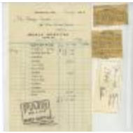
Bill of Sale (2016.2.16) 1944 Economou Family Papers