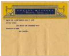
Telegram (2016.2.7) 1931 Economou Family Papers