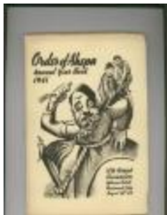
Archival Material (AR AHEPA Yearbooks) NHM Archives