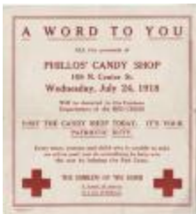
Ad, Magazine (2003.26.10) July 1918