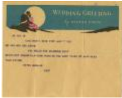
Telegram (2016.2.8) Economou Family Papers