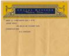
Telegram (2016.2.9) 1931 Economou Family Papers