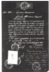
Certificate, Birth (1993.42.2) November 26, 1926,