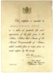
Certificate (1993.8.1) 1939 – 1945