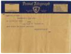
Telegram (2016.2.13) 1931 Economou Family Papers