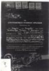
Discharge, Military (1993.42.1) January 9, 1926