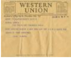
Telegram (2016.2.6) 1931 Economou Family Papers