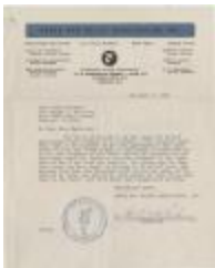
Letter (2018.8.1A) December 9, 1941 Lena Xydes Greek War Relief Association Photo Collection