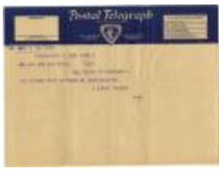
Telegram (2016.2.25) 1931 Economou Family Papers