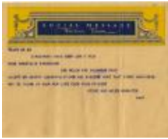
Telegram (2016.2.5) 1931 Economou Family Papers