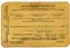
Certificate (1993.42.20) April 27, 1942,