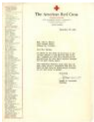
Letter (1995.19.8.10) September 28, 1960