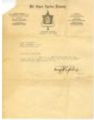
Letter (2001.1.13) 1936