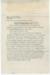
Photograph, Black-and-White (2018.8.2B) December 9, 1941