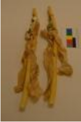
Candle (1996.97.9.B) 1923, 1923