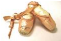
Slipper, Ballet (2007.52.1) 1970 – 2002