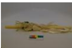
Candle (2003.58.7.B) November 10, 1935, Pagedas Family Collection