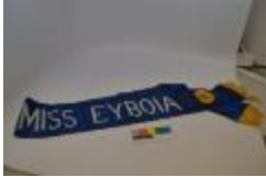
Sash (2006.7.1) 1939,