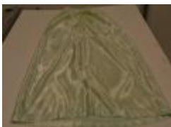
Skirt (2012.24.2) circa 1967,