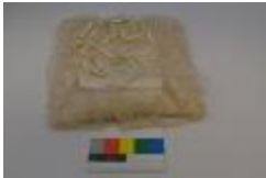
Pillow, Wedding (2002.52.10) 1936, 1936