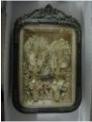
Stefanothiki (2002.52.9) 1936, 1936