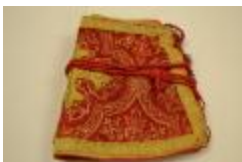
Arm Cuff (2002.45.4.A)