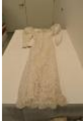
Gown, Wedding (1994.62) October 18, 1917,