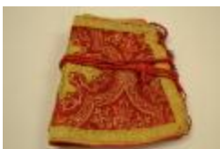
Arm Cuff (2002.45.4.B)