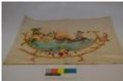
Hanging (1996.13.4) 1890, 1890