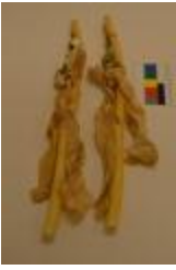
Candle (1996.97.9.A) 1923, 1923