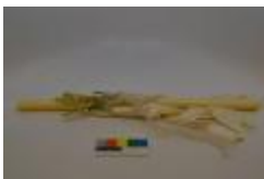
Candle (2003.58.7.A) November 10, 1935, Pagedas Family Collection