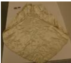
Cape (2001.45.2) 1952,