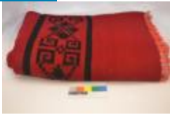
Blanket (1995.42.10) before 1920,