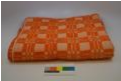
Bedspread (1998.1.1) 1920