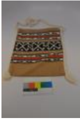
Bag, Tagari (2007.36.7)