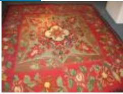
Rug (2007.23.1) circa 1900,