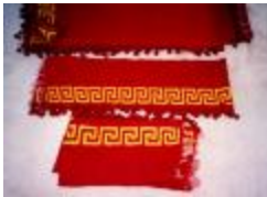
Drapery (2003.33.5.J) 1800s,