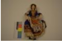
Doll (1994.80.A) 1950 - 1970