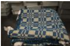
Blanket (1997.41.1) 1920s, 1920s