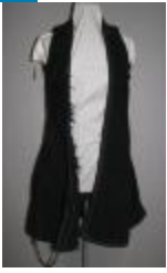
Overcoat (2010.10.4) circa 1925,