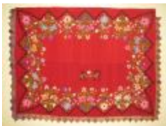
Bedspread (1996.18.1) 1954,