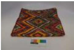
Bag, Tagari (2007.36.8)