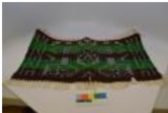
Rug (2001.33.1) 1950s,