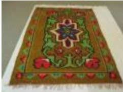
Rug (1993.71.1) circa 1900,