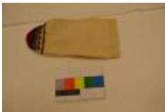
Sock (2003.33.19.A) before 1918, BARBATSULY