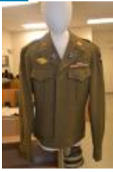
Coat (2017.1.2a) 1943, 1943 – 1948