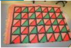
Runner (2001.33.4) 1950s,