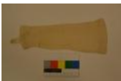
Stocking (2007.42.2.5.A) 1950s,