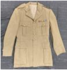
Jacket (2023.13.2A) 1940s