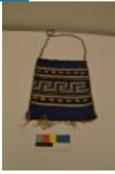
Bag, Tagari (2003.21.1.5) February 25, 2013, 1940 – 1960