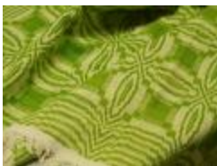
Bedsread (2007.41.2) 1940s,