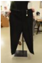
Pants (1998.25.1.B) 1942, 1942 Defenders of Democracy