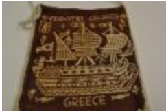
Bag, Tagari (2003.21.1.1) February 25, 2013, 1940 – 1960