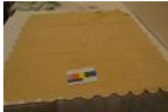
Blanket (2005.5.28) 1930s,