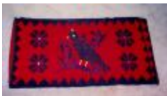
Pillowcase (2003.33.4.A) 1890s, BARBATSULY