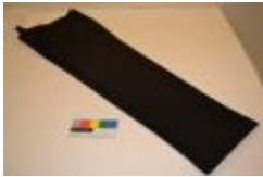
Pants (2006.23.1.C) 1921,