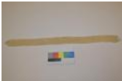
Belt (1994.41.11.D) February 15, 2013, 1926 Marina Textile Collection