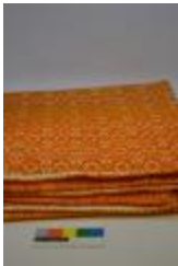
Bedspread (1998.1.3) 1920 - 1930, 1920 - 1930