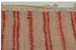
Blanket (2005.2.2.B) circa 1897, 1883 – 1930 Judith's Collection