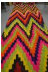
Blanket (2012.14.1) 1890s,