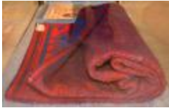
Blanket (2005.25.2) 1946 – 1955,