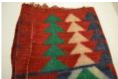
Blanket (2007.31.2) circa 1900,