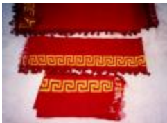
Drapery (2003.33.5.F) 1800s,