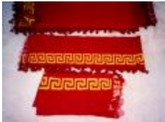
Drapery (2003.33.5.B) 1800s,