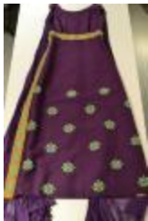
Dress (2011.6.19) 1965,