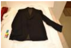
Jacket (1995.11.2.A) 1929,