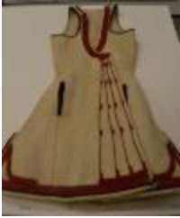
Jacket (2012.30.1) 1940s,