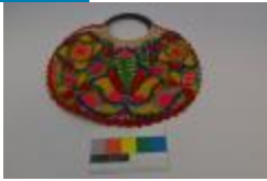
Purse (1993.63.1) 1920 – 1939