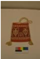
Bag, Tagari (2003.21.1.3) February 25, 2013, 1940 – 1960