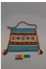
Bag, Tagari (2007.36.5)