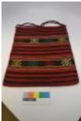
Bag, Tagari (1995.21.1)