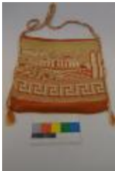
Bag (1993.52.1) before 1920,