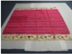
Blanket (2009.4.2) 1904–1926