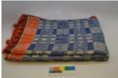
Bedspread (1998.1.2) 1920, 1920