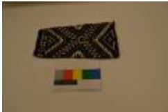
Legging (2010.30.25.A) 1960s,