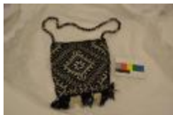
Bag, Tagari (2005.5.33.5)