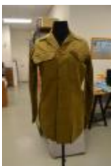
Shirt (1994.117.2.B) Defenders of Democracy