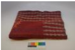
Blanket (2002.4.1) 1906,