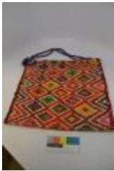
Bag, Tagari (2007.36.10)