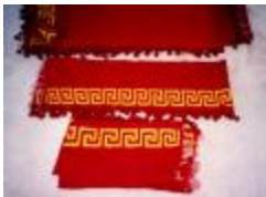
Drapery (2003.33.5.E) 1800s,