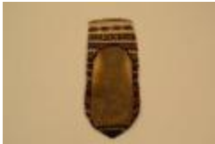
Slipper (2010.30.24.B) 1960s,