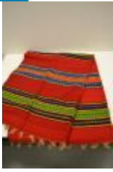
Rug, Throw (2013.24.1)