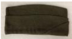
Cap, Garrison (2019.12.3) November 13, 1950