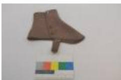
Spat (1996.21.b) 1920s,