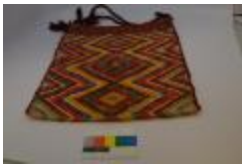
Bag, Tagari (F2016.236)