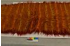
Rug (1997.42.4) February 22, 2013,