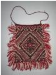
Purse (2010.30.17) 1960s,