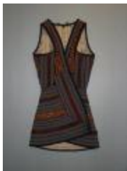
Vest (2010.30.29) 1940s,