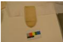
Sock (2003.33.30) BARBATSULY