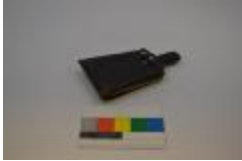
Brush, Polish (F2015.63) circa 1925,