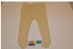
Legging (1994.41.11.E) February 15, 2013, 1926 Marina Textile Collection