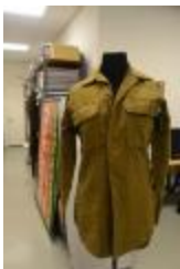
Shirt (1994.117.1.A) Defenders of Democracy