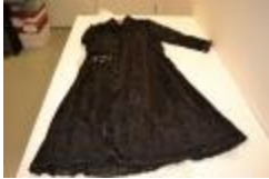
Coat (1999.2) 1907 – 1908,