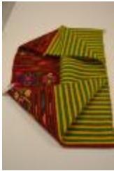
Cover, Pillow (2013.24.3)