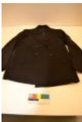
Jacket (2006.23.1.A) 1921,