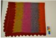
Blanket (2015.1.1) 1912,