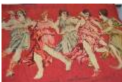
Tapestry (2012.32.6) 1860 – 1870