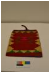
Purse (1997.42.2) February 26, 2013, 1940 – 1960