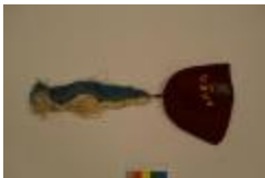
Fez (2007.42.1.1) 1950s,