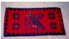
Pillowcase (2003.33.4.B) 1890s, BARBATSULY