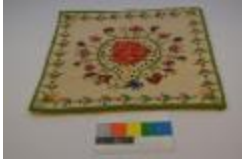
Cover, Pillow (2004.5.55.A)