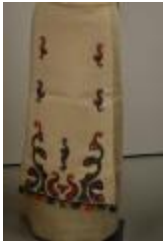
Skirt (1998.26.1.B) 1970, 1970