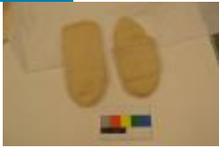
Sock (2003.33.20.A) before 1918, BARBATSULY