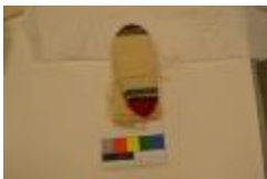
Sock (2003.33.29) before 1918, BARBATSULY