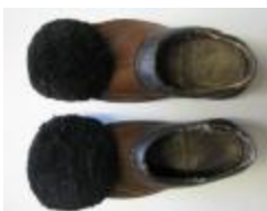
Shoe, Tsarouxia (2008.27.6.B)