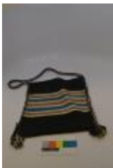
Bag, Tagari (1998.3.1) 1997, 1997