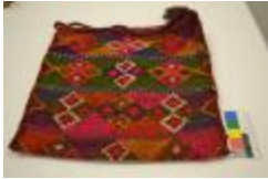
Bag (2002.7.3) 1940s,