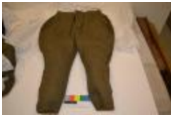
Pants (1998.22.1.B) circa 1918, Defenders of Democracy