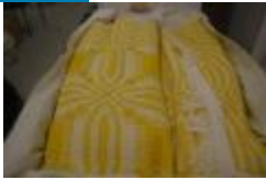
Bedsread (2007.41.4) 1940s,