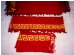
Drapery (2003.33.5.C) 1800s,