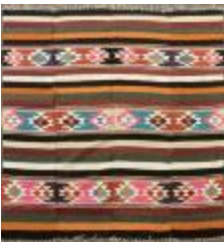
Rug (2024.12.1) 1886