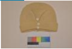
Cap (1994.41.11.G) February 15, 2013, 1926 Marina Textile Collection