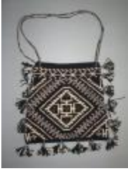
Purse (2010.30.16) 1960s,