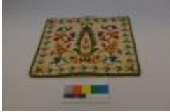
Cover, Pillow (2004.5.55.B)