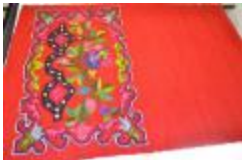
Blanket (2012.32.3) 1860 – 1870