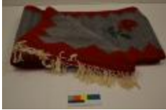
Runner (2007.41.5) 1940s,