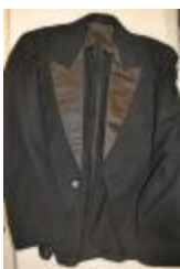
Jacket (2003.58.9.1) November 10, 1935, Pagedas Family Collection