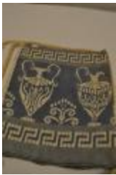
Bag, Tagari (2003.21.1.2) February 25, 2013, 1940 – 1960