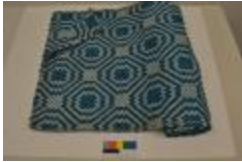
Bedspread (2007.43.3) April 13, 2013, 1930–1940