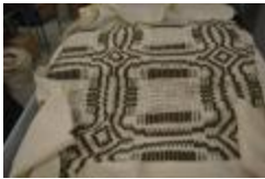
Bedsread (2007.41.1) 1940s,