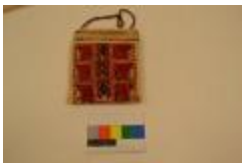
Bag (2003.33.22) 1890s, BARBATSULY