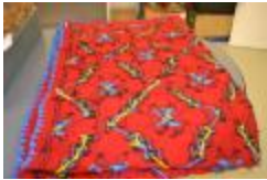
Blanket (2005.25.1) 1946 – 1950,