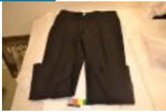
Pants (1998.24.1.B) circa 1990, Defenders of Democracy