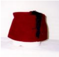
Fez (2003.33.15.A) BARBATSULY