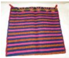
Bag, Tagari (2004.17.5) 1940s,