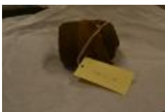
Stocking (1998.22.1.F) 1918, Defenders of Democracy