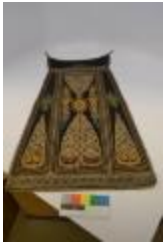
Apron (1993.2.2) 1900s, Thread of Tradition: The Wedding