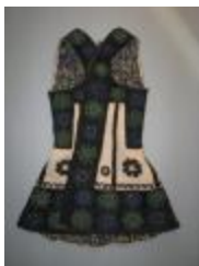
Vest (2010.30.27) 1940s,