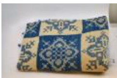
Bedspread (1995.23.3) 1921,