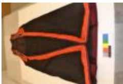
Vest (1994.51.A) 1890 – 1920 Bisioulis Collection