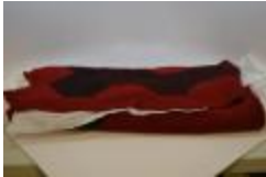
Blanket (2004.9.7) 1949,