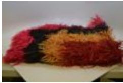
Rug (2004.9.1) 1949,