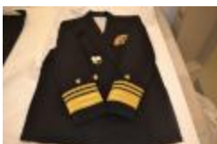
Jacket (1998.24.1.A) circa 1990, Defenders of Democracy