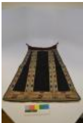
Apron (1993.61.1) 19th century,