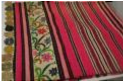
Curtain, Window (2012.32.1) 1860 – 1870