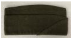
Cap, Garrison (2019.12.5) December 5, 1950