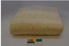
Bedsread (2005.25.3) 1946 – 1950