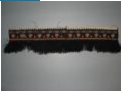
Cloth Fragment (2010.30.23) 1960s,