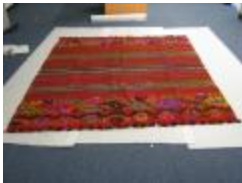
Blanket (2009.4.3) 1904–1926