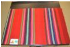
Blanket (2016.1.1) 1911-1954