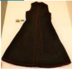
Vest (1994.35.1) 1800s,