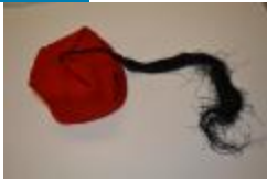
Fez (2012.24.3) 1967,