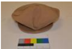
Flatcap (1994.32.1) 1934 - 1989