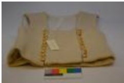
Vest (1998.26.1.A) 1970, 1970