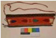
Cumberband (1994.51.B) 1890 – 1920 Bisioulis Collection