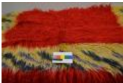
Rug, Flokati (2007.41.10) March 14, 2013, 1940s