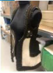
Vest (2019.5.2) 1940s