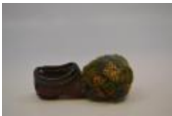
Shoe, Tsarouxia (2006.16.5.B) 1937,