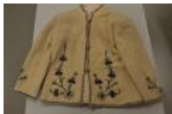
Jacket (2005.5.31) 1960s,