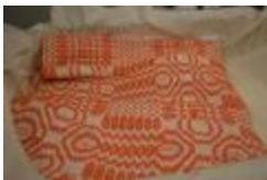
Bedsread (2007.41.3) 1940s,