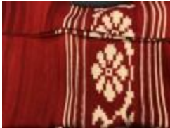
Rug (2019.10.1) circa 1947