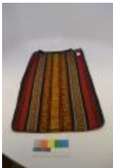
Bag, Tagari (1994.29.2)