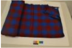
Bedspread (2007.43.4) April 13, 2013, 1930–1940