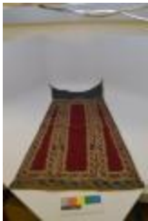
Apron (1993.2.3) 1900s, Threads of Tradition: The Wedding