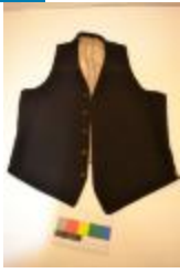
Vest (2006.23.1.B) 1921,