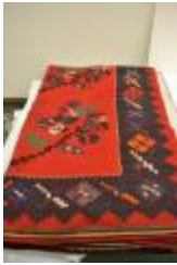
Rug (2003.33.10) 1900 BARBATSULY