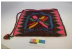
Bag, Tagari (2007.36.4)