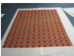
Blanket (2008.34.1) 1930s,