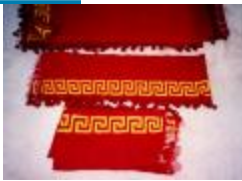
Drapery (2003.33.5.H) 1800s,