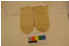
Sock (2003.33.21.B) 1918, BARBATSULY