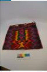
Bag, Tagari (1998.6.1) 1940s,