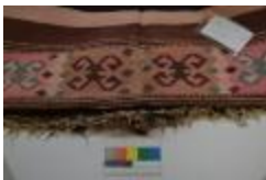
Blanket (2005.26.7) 1928,