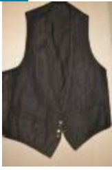
Vest (2003.58.9.2) November 10, 1935