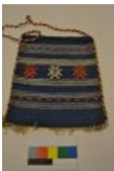
Bag, Tagari (2003.21.1.4) February 25, 2013, 1940 – 1960