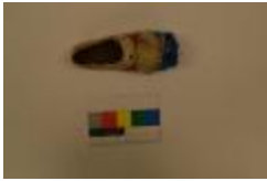
Shoe, Tsarouxia (2007.42.2.8.B) 1950s,