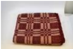
Bedspread (2001.15.5) 1943, 1943