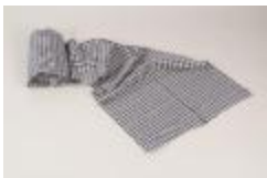
Belt, Cloth (2004.4.1) circa 1930,