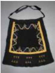
Apron (2010.30.18) 1960s,