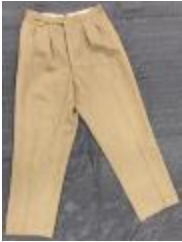
Pants (2023.13.2B) 1940s