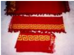
Drapery (2003.33.5.I) 1800s,