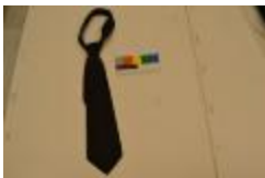
Necktie (1998.19.1.B) 1941 - 1961 Defenders of Democracy