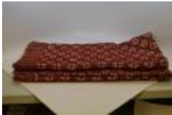
Blanket (2004.9.3) 1949,