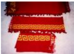
Drapery (2003.33.5.G) 1800s,