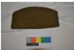
Cap (1998.22.1.G) 1918, 1918 Defenders of Democracy