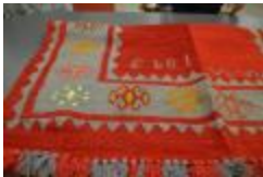
Rug (2006.36.1)