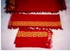
Drapery (2003.33.5.A) 1800s,