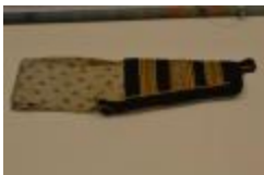
Sleeve (2010.30.21.A) 1960s,