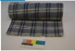
Belt, Cloth (2004.4.2) circa 1930,