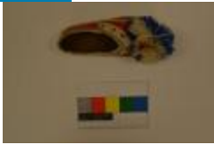
Shoe, Tsarouxia (2007.42.2.8.A) 1950s,