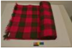
Bedspread (2007.43.5) April 13, 2013, 1930–1940