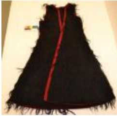
Vest (1994.35.2) 1800s,