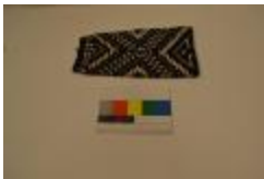
Legging (2010.30.25.B) 1960s,