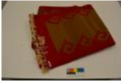
Runner (2007.41.6) 1940s,