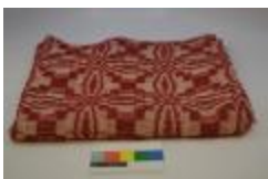
Runner (2001.33.2) 1950s,