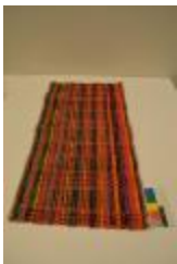
Blanket (2004.17.4) 1940s,