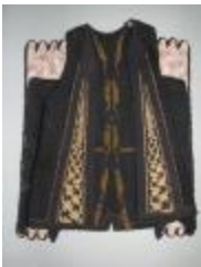
Jacket (2010.30.19) 1960s,