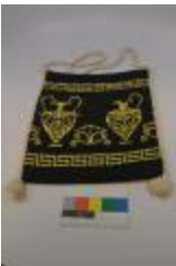
Bag, Tagari (2001.31.42)