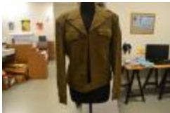
Jacket (1998.27) 1942, 1942