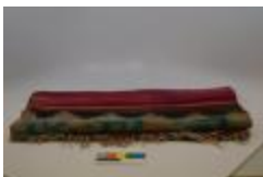
Rug (1994.33.1) 1920