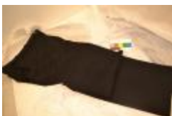
Pants (1998.19.1.D) 1941 - 1961 Defenders of Democracy