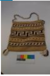
Bag, Tagari (2007.36.6)