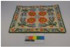
Mat, Table (2007.36.9)