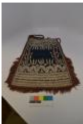
Apron (2005.5.14) 19th century,