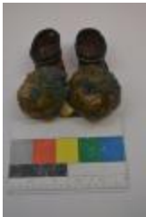
Shoe, Tsarouxia (2006.16.5.A) 1937,