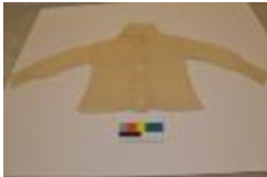
Jacket (1994.41.11.C) February 15, 2013, 1926 Marina Textile Collection