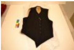
Vest (1995.11.2.C) 1939, 1939