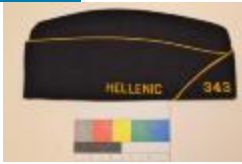
Cap, Service (1994.8.3) 1920 - 1935