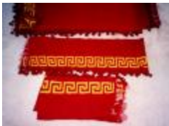
Drapery (2003.33.5.D) 1800s,