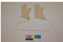
Mitten (1994.41.11.F) February 15, 2013, 1926 Marina Textile Collection