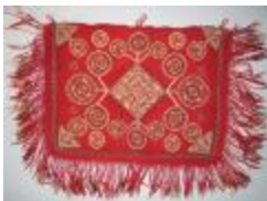
Blanket (2010.30.26) 1960s,