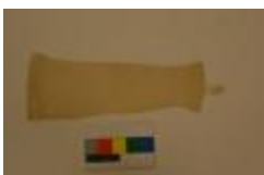
Stocking (2007.42.2.5.B) 1950s,