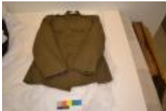
Jacket (1998.22.1.A) circa 1918, Defenders of Democracy