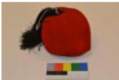
Fez (1996.12.2)