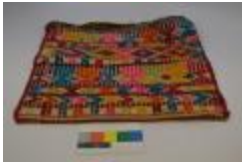
Bag, Tagari (2000.1.9)