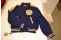
Jacket (1994.123.1) 1954, 1954