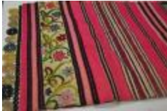
Curtain, Window (2012.32.2) 1860 – 1870