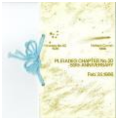
Booklet (2002.51.36) February 25, 1986,