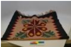
Rug (1993.52.5) 1959,