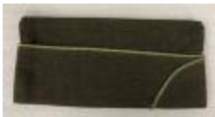
Cap, Garrison (2019.12.4)