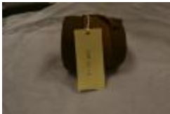
Stocking (1998.22.1.E) 1918, 1918 Defenders of Democracy