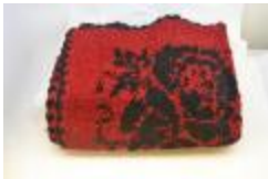
Bedspread (2001.15.6) 1943, 1943