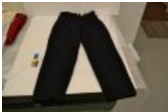
Pants (1995.11.2.B) 1939,