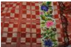
Blanket (2012.32.5) 1860 – 1870