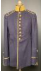
Jacket (2023.13.1) 1940s