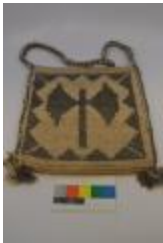
Bag (1993.52.2) 1950s