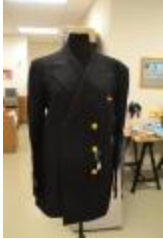
Jacket (1998.25.1.A) 1942, 1942 Defenders of Democracy