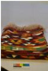
Rug (2004.17.2) 1940s,