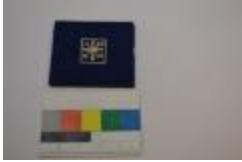
Ornament, Christmas Tree (2001.12.1)