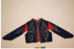
Vest (2007.42.2.2) 1950s,