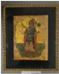
Icon (2001.37.1) 1861,