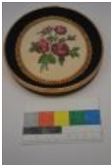
Picture, Woven (2004.5.19)