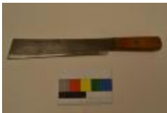
Knife (1998.16.7) February 27, 2013, 1930 – 1940