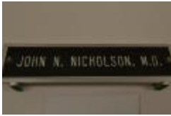
Plaque (2002.62.11) February 21, 2013,