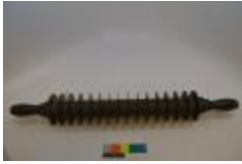
Cutter, Sugar (1996.64.13) CUPID CANDIES