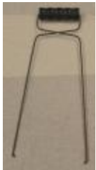
Fryer Hook Set (2007.3.11.A) Angelo's Bakery