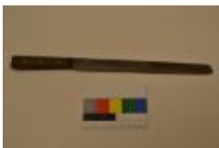
Knife (1998.16.8) February 27, 2013, 1930 – 1940