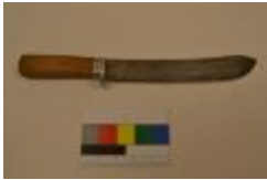
Knife (1998.16.2) 1930 – 1940