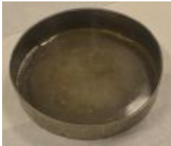
Mold, Cake (2007.3.17) Angelo's Bakery