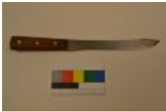
Knife (1998.16.6) February 27, 2013, 1930 – 1940