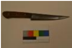
Knife (1998.16.5) February 27, 2013, 1930 – 1940