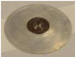
Wheel (2007.3.9.B) Angelo's Bakery