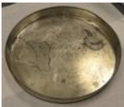
Mold, Cake (2007.3.19) Angelo's Bakery