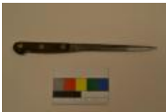
Knife (1998.16.4) February 27, 2013, 1930 – 1940