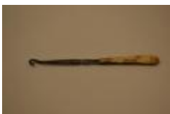
Buttonhook (2001.38.12) 1900, 1800 – 1900