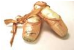
Slipper, Ballet (2007.52.1) 1970 – 2002