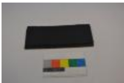
Folder, File (2006.27.21)