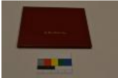
Certificate (2002.62.6) February 19, 2013,