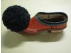
Shoe, Tsarouxia (2009.8.1.14.A)