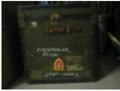
Trunk (2008.32.1) 1920s,