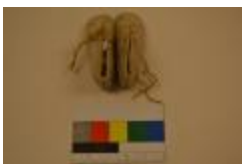
Bootee (1994.41.11.B) February 15, 2013, 1926 Marina Textile Collection