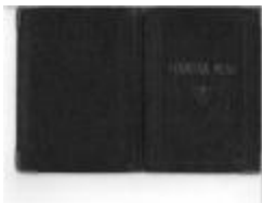
Menu (2011.7.219) 1920 – 1940 Alex's Candy Shop