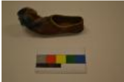
Shoe, Tsarouxia (F2013.44) Nicholas Topping Collection