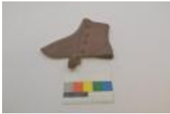
Spat (1996.21.A) 1920s,