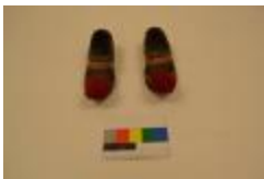
Shoe, Tsarouxia (2003.33.17.A) 1900,