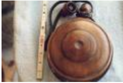
Canteen (2001.38.6) 1877, 1877