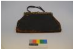
Purse (1993.73.1) circa 1900,