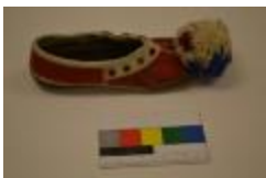
Shoe, Tsarouxia (2013.16.8.B)