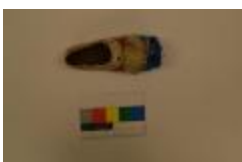
Shoe, Tsarouxia (2007.42.2.8.B) 1950s,