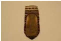
Slipper (2010.30.24.B) 1960s,