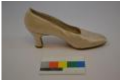
Shoe (1996.5.2.A) 1900s,