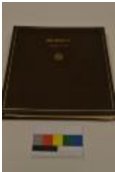
Photo Album (2002.62.8) February 19, 2013, 1983 – 1984