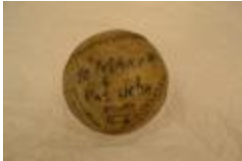
Baseball (F2014.36) circa 1950,