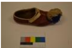
Shoe, Tsarouxia (2007.24.1.G.1) 1927,