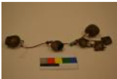
Bell, Animal (1994.19.3)