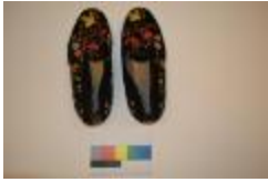
Slipper (2002.7.1.A) 1929,