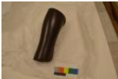
Legging (1998.22.1.C) circa 1918, Defenders of Democracy