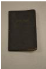
Book, Address (2011.7.256) 1920 – 1940, Alex's Candy Shop