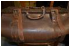
Suitcase (1995.17.1) 1900s,