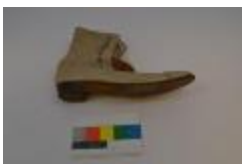
Shoe (2002.52.11.C.1) 1912, 1912