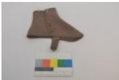
Spat (1996.21.b) 1920s,