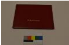
Certificate (2002.62.7) February 19, 2013, 1988