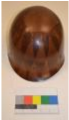
Liner, Helmet (F2014.37) 1940s,