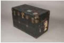
Trunk (2007.43.9) 1920