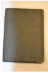
1920 – 1940, Alex's Candy Shop