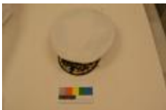
Hat (1998.24.1.C) circa 1990, Defenders of Democracy