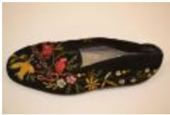
Slipper (2002.7.1.B) 1929,