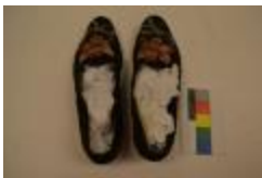
Slipper (1993.24.3A) circa 1910,