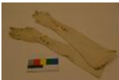
Glove (2006.23.3.B) 1921,