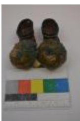
Shoe, Tsarouxia (2006.16.5.A) 1937,