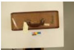
Case (2002.36.3.A) circa 1950,