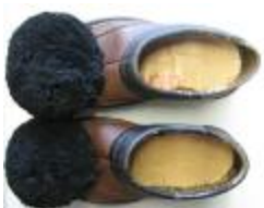
Shoe, Tsarouxia (2008.27.7.A)