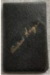
Notepad (2021.5.13) 1920s