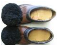
Shoe, Tsarouxia (2008.27.7.B)