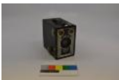
Camera, Box (1993.29.9) 1946 – 1951