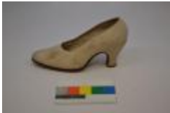
Shoe (1993.10A) February 23, 1930