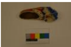
Shoe, Tsarouxia (2007.42.2.8.A) 1950s,