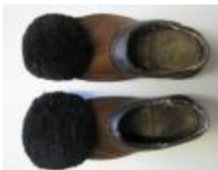
Shoe, Tsarouxia (2008.27.6.A)