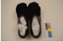
Shoe, Tsarouxia (1993.49.B) 1963, 1963