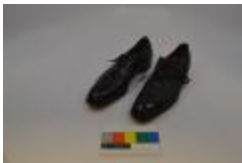
Shoe (1995.41.6.B) 1929,