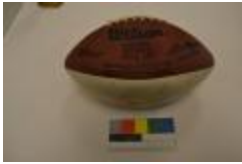
Football (F2014.19) 1987,