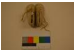
Bootee (1994.41.11.A) February 15, 2013, 1926 Marina Textile Collection