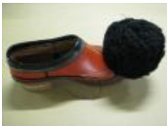
Shoe, Tsarouxia (2009.8.1.14.B)