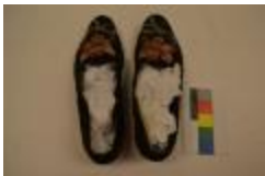
Slipper (1993.24.3B) circa 1910,