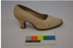
Shoe (1993.10B) February 23, 1930