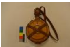
Flask, Pocket (2004.9.8.A) 1960,