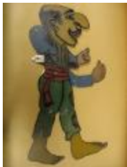
Puppet, Shadow (2002.33.1) 1980s, 1981 – 1989