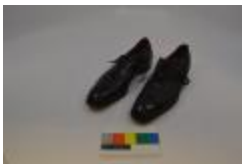
Shoe (1995.41.6.A) 1929,