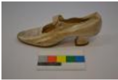
Shoe (1996.6.2.B) October 26, 1904,