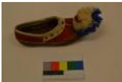
Shoe, Tsarouxia (2013.16.8.A)