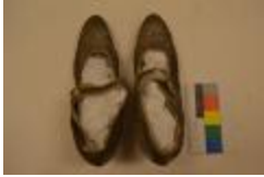
Shoe (1997.42.2.B) 1924, 1924