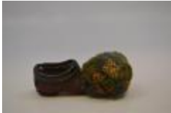
Shoe, Tsarouxia (2006.16.5.B) 1937,