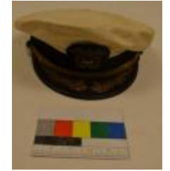
Cap, Sailor (1998.19.2) 1940s,