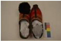
Shoe, Tsarouxia (1993.51.B)