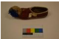
Shoe, Tsarouxia (2007.24.1.G.2) 1927,