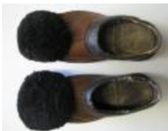
Shoe, Tsarouxia (2008.27.6.B)