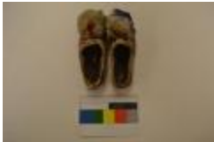
Shoe, Tsarouxia (2004.9.9.B)