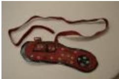
Belt (2012.24.13) 1967,