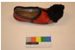
Shoe, Tsarouxia (2006.12.3.A)