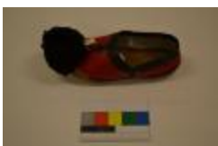
Shoe, Tsarouxia (2006.12.3.B)