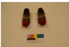
Shoe, Tsarouxia (2003.33.17.B) 1900,