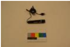
Microphone (F2013.94.B) circa 1960,