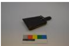
Brush, Polish (F2015.63) circa 1925,