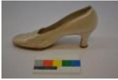
Shoe (1996.5.2.B) 1900s,