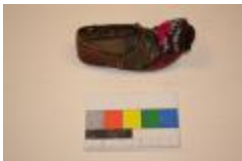
Shoe, Tsarouxia (2006.12.1.C)