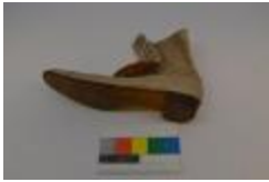
Shoe (2002.52.11.C.2) 1912, 1912