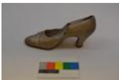
Shoe (1995.41.7) 1929,