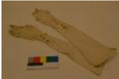
Glove (2006.23.3.A) 1921,