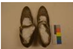
Shoe (1997.42.2.A) 1924, 1924