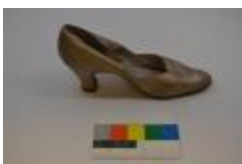
Shoe (1995.41.8) 1929,