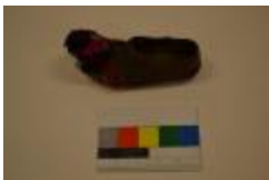
Shoe, Tsarouxia (2006.12.1.B) circa 1930,