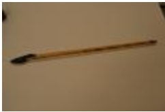
Bow, Violin (2012.21.2)