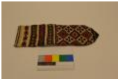
Slipper (2010.30.24.A) 1960s,