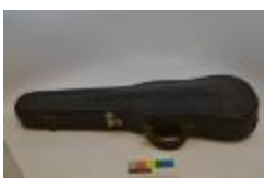
Case, Violin (1995.50.1.C) circa 1939,