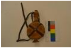
Flask, Pocket (2004.9.8.B) 1960s,