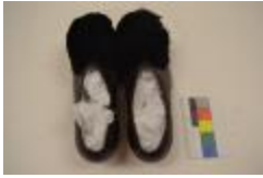
Shoe, Tsarouxia (1993.49.A) 1963, 1963