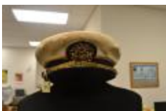
Hat (1998.25.1.C) 1942, 1942 Defenders of Democracy