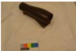
Legging (1998.22.1.D) circa 1918, Defenders of Democracy