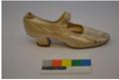
Shoe (1996.6.2.A) October 26, 1904,