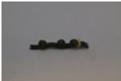
Bell (2005.30.9) BARBATSULY