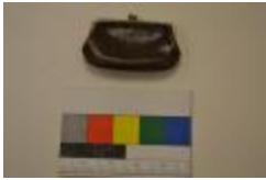
Purse, Change (1994.41.16.A) 1900 – 1930