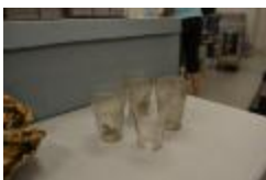
Cup (2011.7.4) 1930 – 1940, Alex's Candy Shop