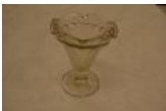
Dish, Ice Cream (2011.7.82) 1920 – 1940 Alex's Candy Shop