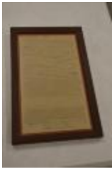
Contract (2011.7.188) 1920 – 1940, Alex's Candy Shop