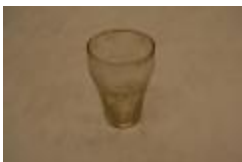
Cup (2011.7.62) 1920 – 1940 Alex's Candy Shop