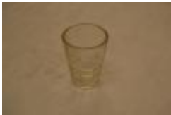
Cup (2011.7.68) 1920 – 1940 Alex's Candy Shop