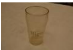
Cup (2011.7.72) 1920 – 1940 Alex's Candy Shop