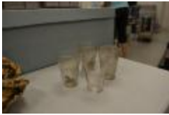
Cup (2011.7.5) 1930 – 1940, Alex's Candy Shop