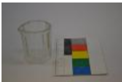
Pitcher (1996.64.10.F) CUPID CANDIES