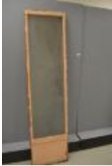
Windowpane (2011.7.271) 1920 – 1940, Alex's Candy Shop