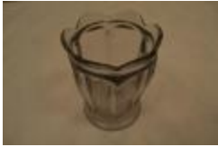
Bowl (2011.7.98) 1920 – 1940, Alex's Candy Shop