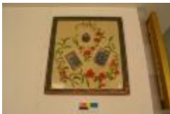
Picture, Needlework (2013.22.1) circa 1925,