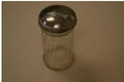
Shaker, Sugar (2012.23.17) Ramova Grill Collection