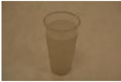
Cup (2011.7.74) 1920 – 1940 Alex's Candy Shop