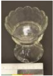
Dish, Ice Cream (2007.1.2) 1900s,