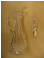
Cruet (2005.30.8) February 11, 2013, 1940 – 1960 BARBATSULY