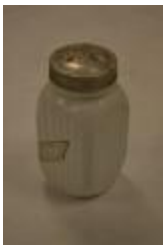
Set, Salt & Pepper (2011.7.201) 1920 – 1940 Alex's Candy Shop