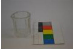
Pitcher (1996.64.10.C) CUPID CANDIES