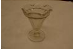
Dish, Ice Cream (2011.7.83) 1920 – 1940, Alex's Candy Shop