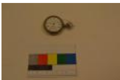
Watch, Pocket (2014.1.3)