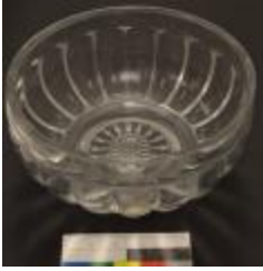
Bowl, Serving (2007.1.7) 1900s,