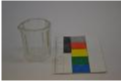
Pitcher (1996.64.10.M) CUPID CANDIES