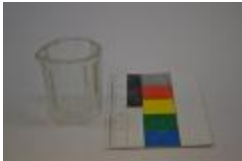
Pitcher (1996.64.10.D) CUPID CANDIES