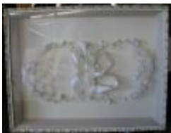
Stefanothiki (1996.54.2) October 26, 1969,