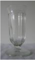
Dish, Ice Cream (2003.5.1) Alex's Candy Shop