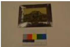
Postcard (2002.51.12.2) circa 1800,