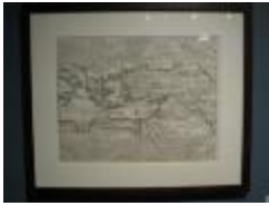
Map (2008.33.4) circa 1500,