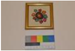
Embroidery (1995.35.1.B) February 18, 2013, 1900 Evangelos Collection