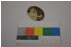
Mirror, Hand (2016.11.1) 1930s,