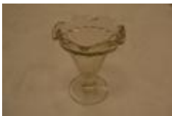
Dish, Ice Cream (2011.7.81) 1920 – 1940 Alex's Candy Shop