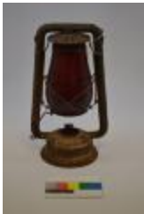
Lantern, Kerosene (2006.13.4)