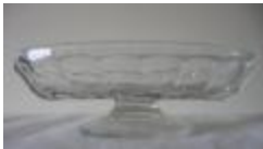
Dish, Ice Cream (1996.96.1.B) DOVE CANDY