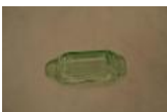
Dish, Dessert (2011.7.91) 1920 – 1940, Alex's Candy Shop