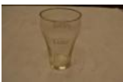
Cup (2011.7.64) 1920 – 1940 Alex's Candy Shop