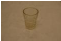
Cup (2011.7.69) 1920 – 1940 Alex's Candy Shop