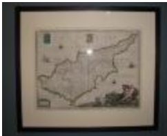
Map (2008.33.7) 1635,