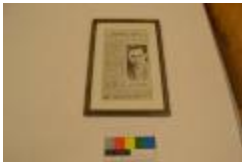
Newspaper Clipping (1996.50.6) February 1, 1932,