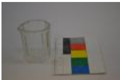
Pitcher (1996.64.10.G) CUPID CANDIES