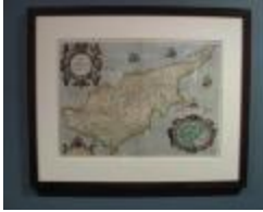
Map (2008.33.5) 1573,