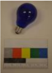
Bulb, Light (2000.11.2.17.C)