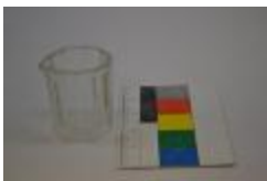
Pitcher (1996.64.10.A) CUPID CANDIES