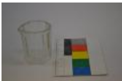
Pitcher (1996.64.10.I) CUPID CANDIES