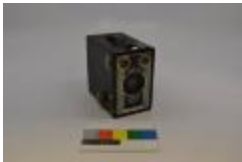
Camera, Box (1993.29.9) 1946 – 1951