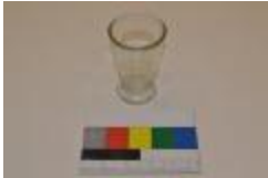
Glass, Dessert (F2013.12.B)