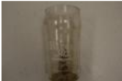
Cup (2011.7.13) 1930 – 1940, Alex's Candy Shop