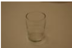
Glass (2012.23.13) Ramova Grill Collection