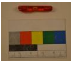
Level, Mason's (2000.11.2.15)