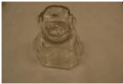
Jar, Food-storage (2011.7.99) 1920 – 1940 Alex's Candy Shop