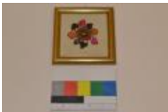
Embroidery (1995.35.1.A) February 18, 2013, 1900 Evangelos Collection