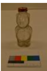
Bottle (2014.3.1) 1950s,