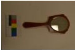
Mirror, Hand (1993.29.7.A) circa 1930,