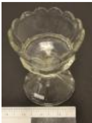
Dish, Ice Cream (2007.1.4) 1900s,