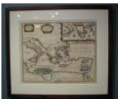
Map (2008.33.3) 1660,