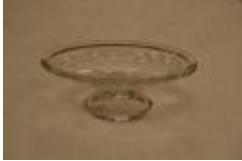
Dish, Ice Cream (2011.7.84) 1920 – 1940 Alex's Candy Shop