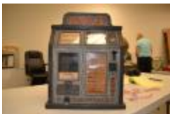
Gumball Machine (2011.7.19) 1920 – 1940, Alex's Candy Shop