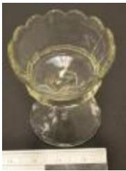
Dish, Ice Cream (2007.1.3) 1900s,