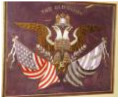
Picture, Needlework (2005.21.2) 1876 – 1886