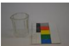
Pitcher (1996.64.10.K) CUPID CANDIES