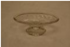
Dish, Ice Cream (2011.7.86) 1920 – 1940 Alex's Candy Shop