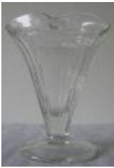
Dish, Ice Cream (2003.8.1)