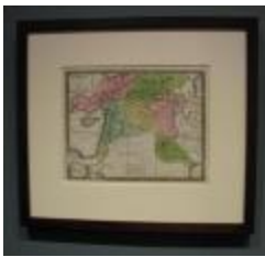
Map (2008.33.1) 1845,