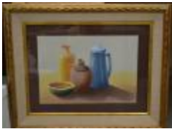
Painting (2012.27.5) 1995,