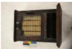
Dispenser, Match (F2012.2) 2012,