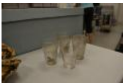
Cup (2011.7.3) 1930 – 1940, Alex's Candy Shop