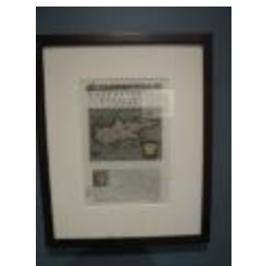
Map (2008.33.8) 1590,