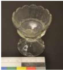
Dish, Ice Cream (2007.1.1) 1900s,