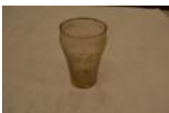
Cup (2011.7.63) 1920 – 1940 Alex's Candy Shop