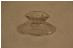
Dish, Ice Cream (2011.7.87) 1920 – 1940, Alex's Candy Shop