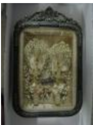
Stefanothiki (2002.52.9) 1936, 1936