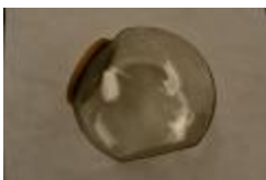
Jar, Food-storage (2011.7.103) 1920 – 1940, Alex's Candy Shop