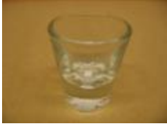
Glass, Shot (2005.30.7.3) February 11, 2013, BARBATSULY