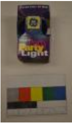
Bulb, Light (2000.11.2.17.A)