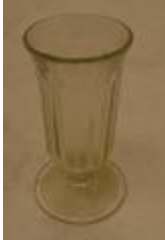
Dish, Ice Cream (2011.7.76) 1920 – 1940 Alex's Candy Shop