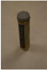
Bottle, Medicine (2011.7.208) 1930s, Alex's Candy Shop