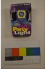
Bulb, Light (2000.11.2.17.B)