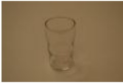
Glass (2012.23.14) Ramova Grill Collection