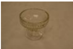
Dish, Ice Cream (2011.7.79) 1920 – 1940, Alex's Candy Shop