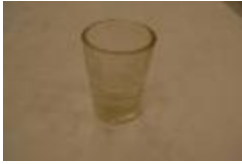
Cup (2011.7.66) 1920 – 1940 Alex's Candy Shop