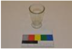
Glass, Dessert (F2013.12.A)