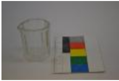
Pitcher (1996.64.10.L) CUPID CANDIES