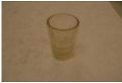
Cup (2011.7.67) 1920 – 1940 Alex's Candy Shop