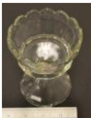
Dish, Ice Cream (2007.1.5) 1900s,