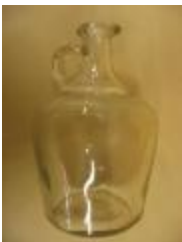
Cruet (2001.38.36) 1900s,