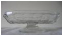
Dish, Ice Cream (1996.96.1.D) DOVE CANDY