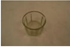
Bowl (2011.7.93) 1920 – 1940, Alex's Candy Shop