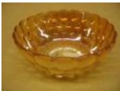
Dish, Pudding (2005.30.4.A)