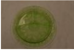
Plate (2011.7.146) 1920 – 1940 Alex's Candy Shop