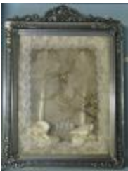
Stefanothiki (1993.29.8) November 6, 1930,