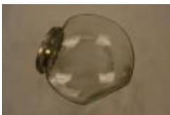
Jar, Food-storage (2011.7.102) 1920 – 1940, Alex's Candy Shop