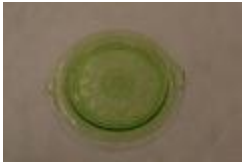
Plate, Serving (2011.7.147) 1920 – 1940 Alex's Candy Shop