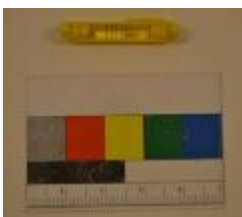
Level, Mason's (2000.11.2.16)