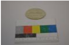
Mirror, Hand (2016.11.5) 1930s,