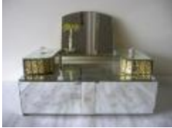
Box, Candy (1993.29.4) 1930s, DELOS CANDIES