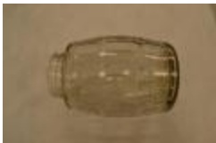
Candy Jar (2011.7.35) after 1929, Alex's Candy Shop