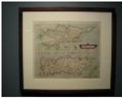
Map (2008.33.6) 1573,