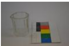
Pitcher (1996.64.10.H) CUPID CANDIES