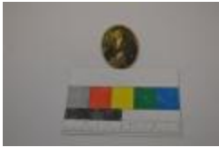
Mirror, Hand (2016.11.3) 1930s,