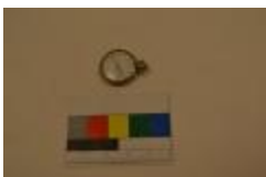
Watch, Pocket (2014.1.4)