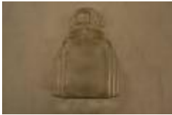
Jar, Food-storage (2011.7.100) 1920 – 1940 Alex's Candy Shop