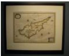
Map (2008.33.2) 1660,