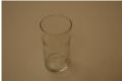
Glass (2012.23.15) Ramova Grill Collection