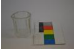
Pitcher (1996.64.10.E) CUPID CANDIES