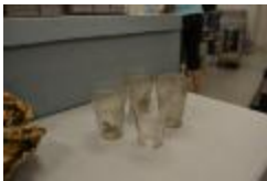
Cup (2011.7.2) 1930 – 1940, Alex's Candy Shop