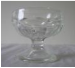
Dish, Ice Cream (2003.6.1.F)