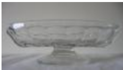
Dish, Ice Cream (1996.96.1.C) DOVE CANDY