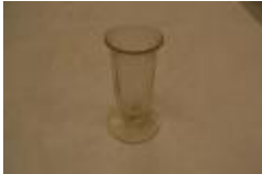
Dish, Ice Cream (2011.7.77) 1920 – 1940 Alex's Candy Shop