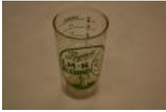
Cup (2011.7.75) 1920 – 1940, Alex's Candy Shop