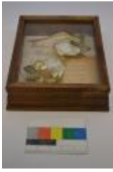
Box, Shadow (2003.58.6.3) 1985, Pagedas Family Collection