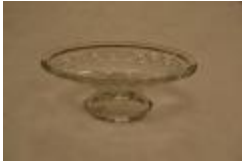
Dish, Ice Cream (2011.7.85) 1920 – 1940 Alex's Candy Shop