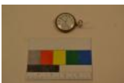
Watch, Pocket (2014.1.5)