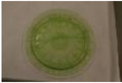
Plate (2011.7.145) 1920 – 1940 Alex's Candy Shop