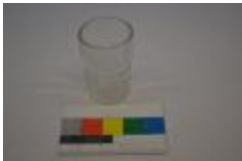
Cup (2011.7.18) 1920 – 1940, Alex's Candy Shop