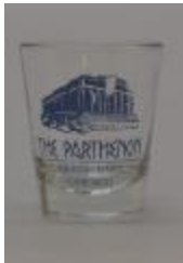
Glass, shot (2017.12.1) 1968 – 2016 The Parthenon Restaurant Collection