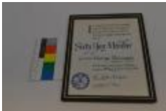
Certificate, Commemorative (2015.15.7) February 18, 1989,