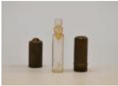
Bottle, Medicine (2001.38.15)