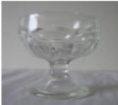
Dish, Ice Cream (2003.6.1.B)