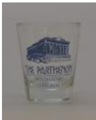
Glass, shot (2017.12.2) 1968 – 2016 The Parthenon Restaurant Collection