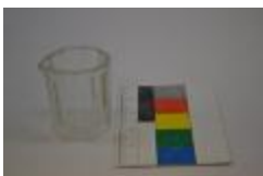
Pitcher (1996.64.10.J) CUPID CANDIES