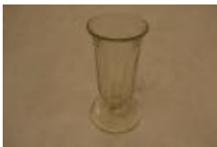
Dish, Ice Cream (2011.7.78) 1920 – 1940 Alex's Candy Shop