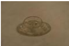
Dish, Dessert (2011.7.88) 1920 – 1940 Alex's Candy Shop