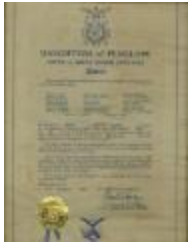
Certificate, Membership (2006.33.21) July 15, 1945