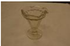
Dish, Ice Cream (2011.7.80) 1920 – 1940 Alex's Candy Shop