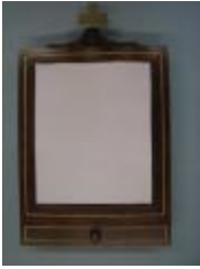
Stand (1993.28.1) March 12, 2013