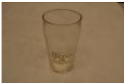
Cup (2011.7.70) 1920 – 1940 Alex's Candy Shop