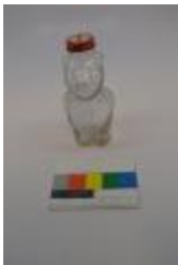
Mold, Glass (2016.7.1) 1990s,