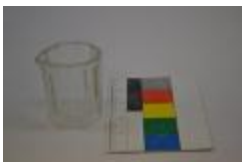
Pitcher (1996.64.10.B) CUPID CANDIES