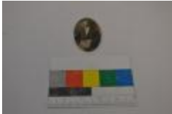
Mirror, Hand (2016.11.4)