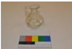
Pitcher, Cream (F2013.13.B)