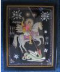
Picture, Needlework (2010.32.1)