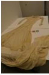
November 10, 1935