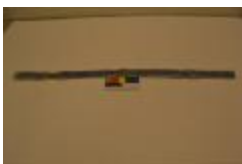
Sash (2006.33.18) March 4, 1945,