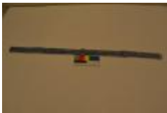
Sash (2006.33.16) March 4, 1945,