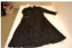
Coat (1999.2) 1907 – 1908,