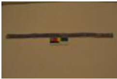
Sash (2006.33.14) March 4, 1945,