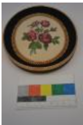
Picture, Woven (2004.5.19)