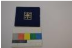
Ornament, Christmas Tree (2001.12.1)