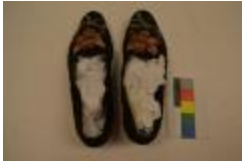
Slipper (1993.24.3A) circa 1910,