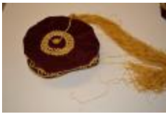
Fez (2012.24.4) 1967,