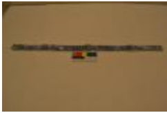
Sash (2006.33.19) March 4, 1945,