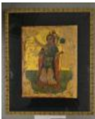
Icon (2001.37.1) 1861,