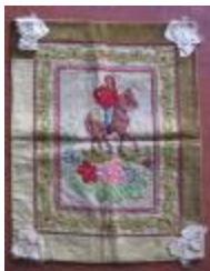
Tapestry (2008.3.3) March 13, 2013, 1920 – 1921