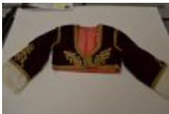
Vest (2012.24.8) 1967,