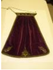
Apron (1996.2.A) 1924, 1924