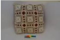
Pillow (2004.5.17) circa 1950,