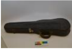
Case, Violin (1995.50.1.C) circa 1939,