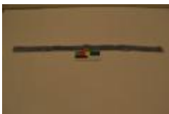
Sash (2006.33.17) March 4, 1945,