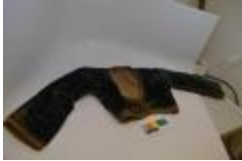
Jacket (2016.12.1) circa 1870,