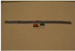
Sash (2006.33.15) March 4, 1945,