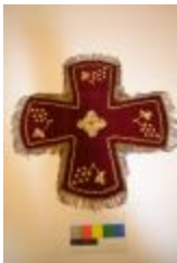
Veil, Chalice (2003.27.3)