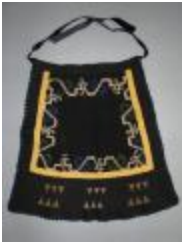
Apron (2010.30.18) 1960s,