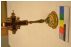
Cross (2003.45.1) circa 1930,