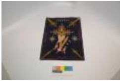
Hanging (2005.26.2) 1928,