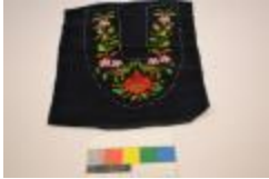
Cloth Fragment (2004.3.2.1)