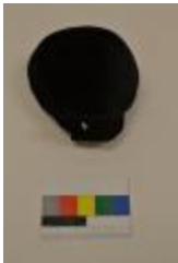
Hat (1999.9.7) 1950s, 1950 – 1970