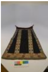
Apron (1993.61.1) 19th century,