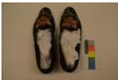
Slipper (1993.24.3B) circa 1910,