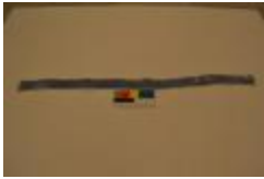
Sash (2006.33.12) March 4, 1945,