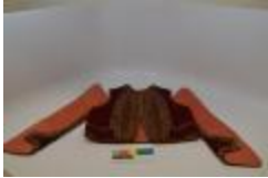
Vest (1993.22.1) 1954,