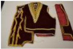
Vest (2012.24.7) 1967,