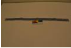
Sash (2006.33.13) March 4, 1945,