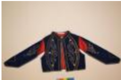
Vest (2007.42.2.2) 1950s,