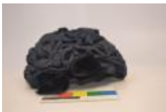
Hat (1999.9.9) 1950 – 1970