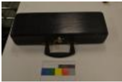
Case for Flute (1997.43.1.B) circa 1910,