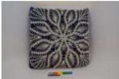
Pillow (2004.5.16) 1950s,