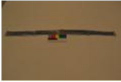
Sash (2006.33.11) March 4, 1945,