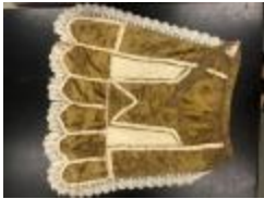
Apron (2019.5.1) 1930s